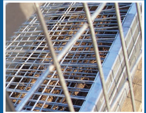
3.5mm Welded Wire Mesh.